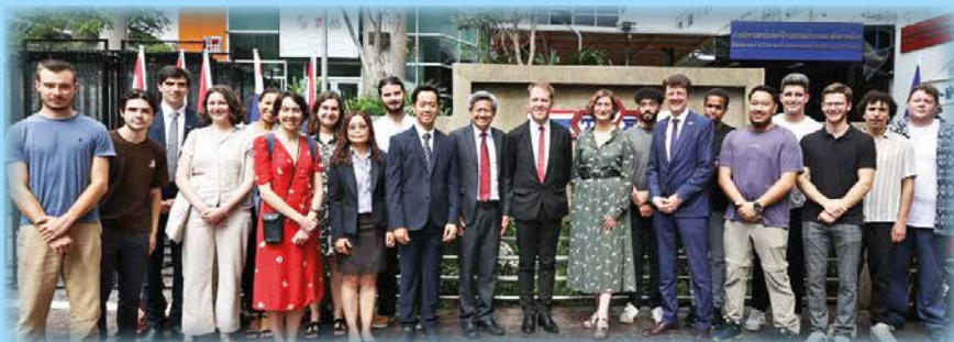
Picture: French Delegates take a group picture with KMUTNB executives and French students who are doing an internship at KMUTNB.